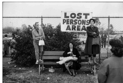
ELLIOTT ERWITT USA, Pasadena, California, 1963