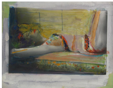
SAUL LEITER Untitled (100217) , date unknown

Jackson Fine Art's upcoming exhibition explores Leiter's nude portraiture in black and white, and the relationship between that work and Leiter's unique use of color with a series of painted silver gelatin prints. Leiter developed the practice of painting over his photographs of nude figures, creating hundreds of these works from the 1960's to the early 1990's. His combination of two mediums that are traditionally kept scrupulously apart has left us with a striking body of work, recalling both the Impressionists and the erotic energy of Egon Schiele.