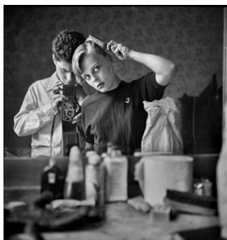
ELLIOTT ERWITT France, Paris, 1952

Photographic master Elliott Erwitt has created many noteworthy portraits of womankind over the years. Regarding Women is Erwitt's evocative personal tribute to female strength, intelligence, and beauty. Conveying respect, admiration, and sometimes awe, these photographs portray all the complex elements that make up the feminine nature, whether formidable and tenacious, or occasionally capricious and coy. Through capturing their many varied facets, Erwitt shares his insights into how all kinds of women make their way in—not to mention their mark on—the world. These iconic silver gelatin prints, spanning Erwitt's career, portray romance and glamour, touches of sensuality and much affection; not to mention those disarming flashes of candid everyday humor that are so quintessentially Erwitt.