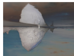
Richard Misrach, Untitled #1026

The photographs comprising Misrach's Notations began in concert with the photographer's 2006 departure from analog photography to working exclusively digitally. In this debut exhibition at 3122, we are able to explore this shift toward an increasing interest in the photographic negative — an object rendered obsolete by digital photography's advent. For the works in Notations , Misrach creates a color negative of his sparsely populated landscapes, a process he describes as making a positive a negative, thereby "making the familiar unfamiliar to force us into a deeper awareness of our world and surroundings, as well as our own actions." Inspired by Ansel Adam's comparison of a negative to a musical score — in that it can be oriented, printed, and exhibited in myriad ways — and by John Cage's 1969 book Notations , for which the avant-garde composer reinterprets and re-presents the scores of a selection of musicians as visual art. In 2023, Misrach collaborated with Alonzo King LINES Ballet, creating large-scale visuals to back the company's heart-stirring choreography.