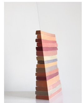
Mary Ellen Bartley, Pyramid , 2022

Chromatic Fiction , Mary Ellen Bartley's painterly and abstract treatment of another vessel of narrative possibility, the printed book, will be on view at the gallery for the first time. Curated from four of the photographer's celebrated series — Reading in Color , Reading Grey Gardens , Reading November , and the brand new Split Stacks — the exhibition invites viewers to consider the quiet beauty of the material form that houses innumerable stories and ideas. Some works are more purely formal ( Reading in Color , Split Stacks , Reading November ), sculptural studies of candy-colored and worn paperbacks or moody and mysterious hardcovers reminiscent of Renaissance oils. Other series — like Morandi's Books , on view concurrently at the Museo Morandi, Bologna, Italy, or Reading Grey Gardens mine the intimate libraries of real people that fascinate or inspire Bartley for clues about their owners' secret lives. Like Halaban's window scenes, Bartley's photographs of the books left behind by Jacqueline Kennedy cousins “Big” and “Little” Edie Bouvier Beale invite viewers to weave together their own narratives about the volumes' storied histories.