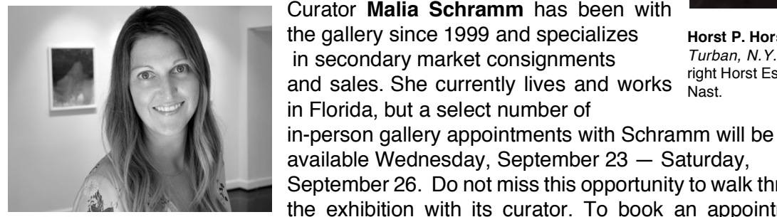
please click here.