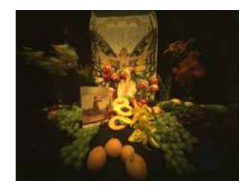
WILLIE ANNE WRIGHT Fruits and Flowers with Postcard #2, 1981