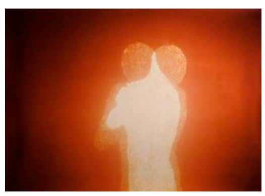
CHRISTOPHER BUCKLOW Tetrarchs 2:03pm, 30- June, 2011

Christopher Bucklow is one of the leading figures of the contemporary British 'cameraless' photography movement. His other-worldly photographs of radiant men and women set against grounds of color are made through a complex multi-step process which begins with the artist