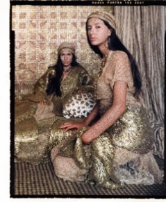
LALLA ESSAYDI Bullets Revisited #30, 2014